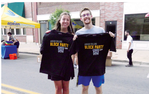
Student Welcome Back Event

“Michigan Main Street is providing us with a foundation of information and services that will allow us to better support our businesses and community. We are just beginning our journey and we are already seeing the great benefits of Michigan Main Street.”