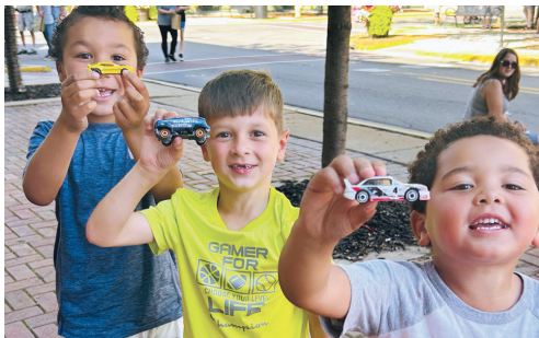
Hot Wheels Giveaway