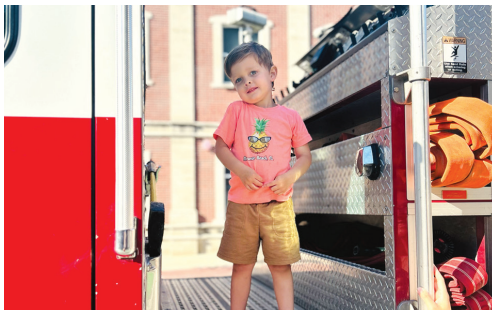
Touch a truck