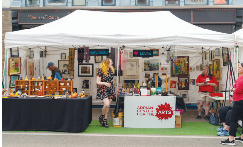
Artalicious Fine Arts Fair