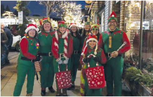
Holly Jolly Boyne