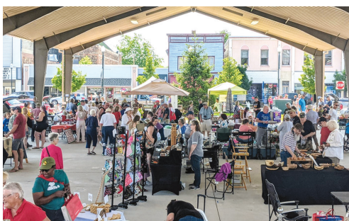
Cheboygan Farmers Market

“We’ve been a Michigan Main Street community for the last five years and it has brought so much greatness to our community by reviving downtown. Even with how incredible the last five years have been, I can’t wait to ‘blow the socks’ off those years with our future plans and goals.”