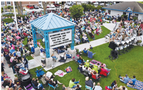
Music on Main Summer Concert Series