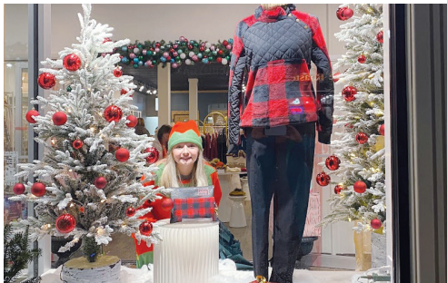
Mystery Elf during Hospitality Night