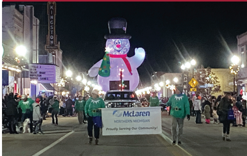
Parade of Lights