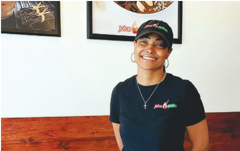
Over $1.8 million in Small Business Grants uplifted downtown businesses.