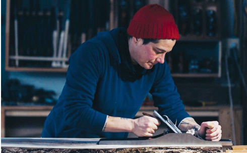
Nine new businesses opened in 2024, diversifying the downtown experience.