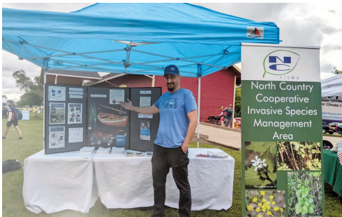
Environmental Educational Expo 2024