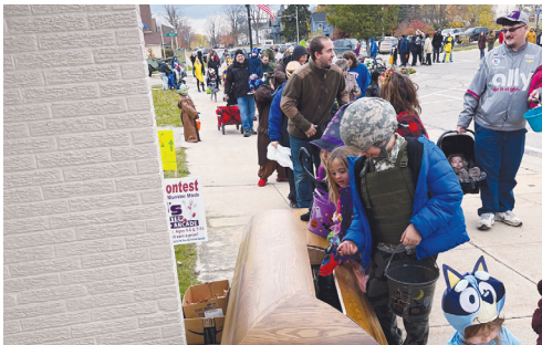
Monster Mash Trick or Treat