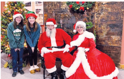
Miracle on Main Christmas Event

“Michigan Main Street has been a valuable partner to the Evert DDA. They have helped fund the renovations to a downtown building as well as make connections with developing experts and downtown building owners.”