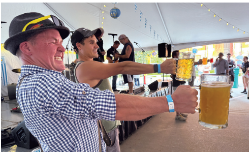
Beer stein holding competition at Rocktoberfest

"The Main Street program is vital to downtown Howell, driving economic growth, preserving historic character, and fostering a strong sense of community. It attracts businesses, enhances public spaces, and ensures a lively, welcoming environment for all."