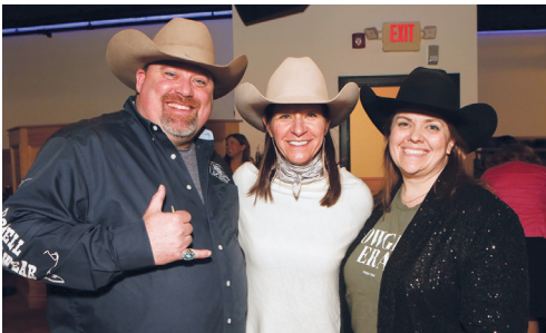
Howell Western Wear wins "Best Downtown Business" award