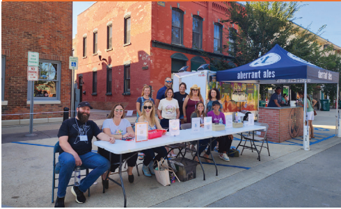
Happy volunteers celebrate 2024 Rock the Block season