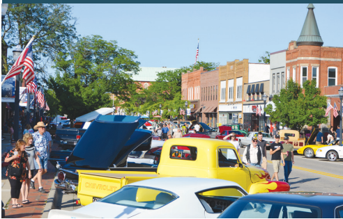
Lapeer Car Cruise