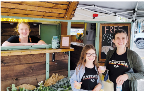
Ladies Night Out