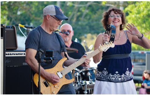
Summer Concert Series