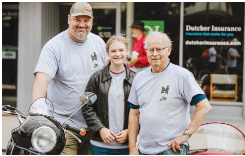
Owosso Vintage Motorcycle Days