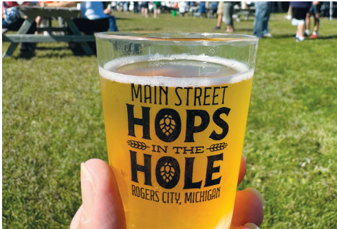
Hops in the Hole