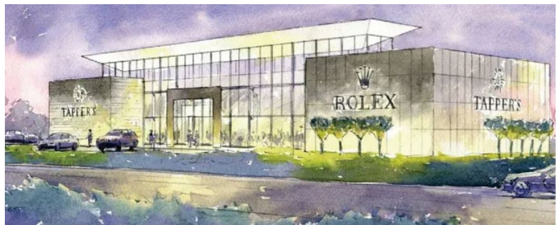
Figure 4: TFJ of Novi - hometownlife.com

Consideration of the request of Broder and Sachse Real Estate for approval of the Preliminary Site Plan and Stormwater Management Plan. The subject property contains 1.16 acres and is located in Section 36, on the east side of Haggerty Road, north of Eight Mile