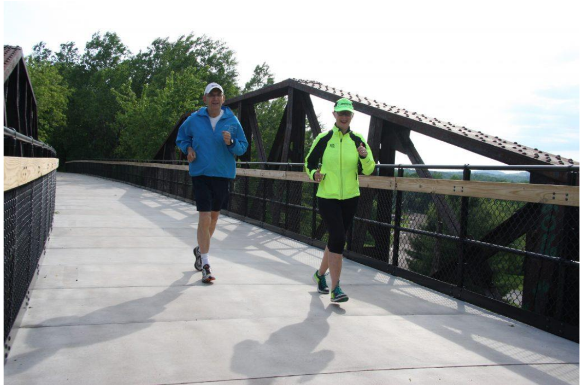
Existing Iron Belle Trail in Bessemer